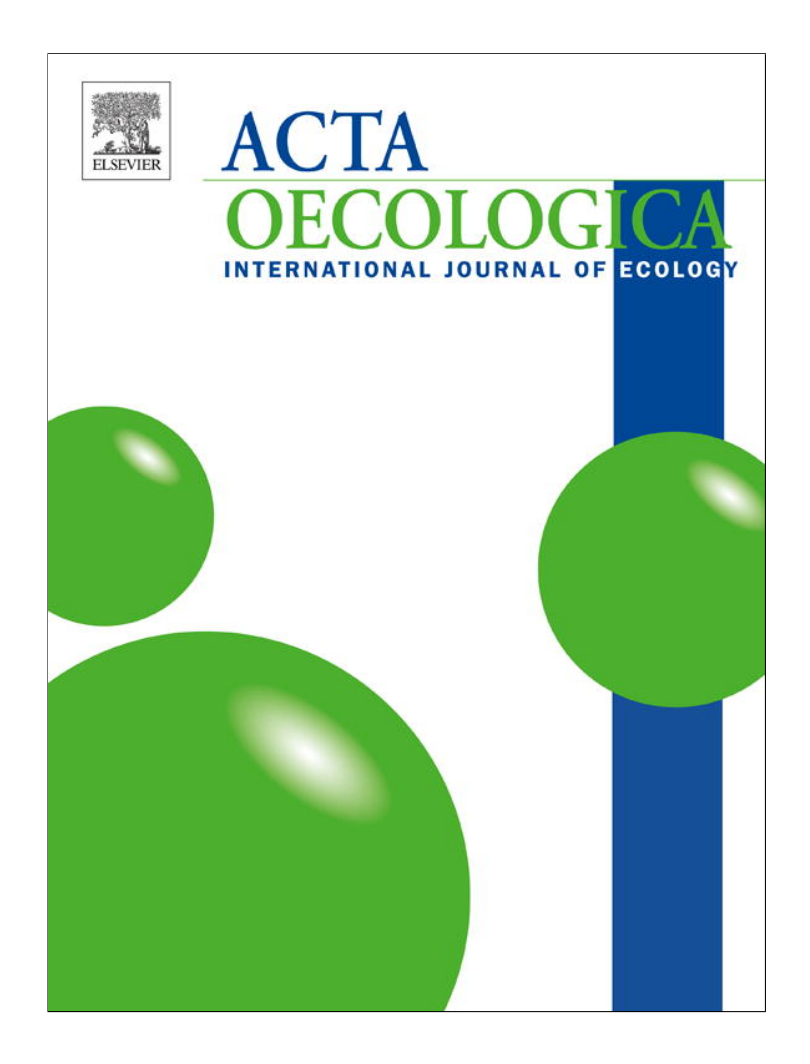
(This is a sample cover image for this issue. The actual cover is not yet available at this time.)

Provided for non-commercial research and education use. Not for reproduction, distribution or commercial use.